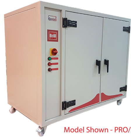
Model Shown - PRO/500H/TDIG

This range of Prime XL Ovens are the flagship brand of Genlab Ovens. These are built to the highest standards and packed with features and enhancements. As standard, the Prime XL range offers heavy duty stainless steel interior, increased accuracies on our standard models and are quicker responding. Built around a heavy duty panelled framework, we can offer increased load capability in this range, multiple reinforced shelves and operate at 300°C continuously. They feature our latest touch screen control system which offers intuitive control designed for industrial ovens.