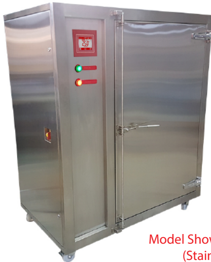
Model Shown - PRO/750V/TDIG/SSE (Stainless Steel Exterior)