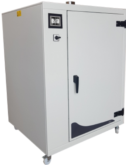
Model Shown - ME/500/TDIG