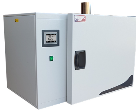
Model Shown - ME/100/TDIG

The Genlab range of Moisture Extraction Ovens are specifically designed to provide rapid drying and removal of excess moisture. Increased air circulation around the chamber and larger extraction vents offers superior drying times.