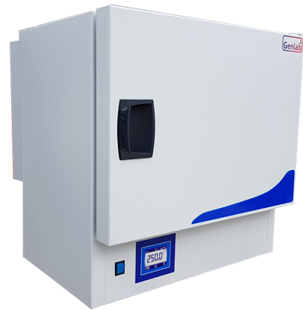
Model Shown - MINIS/50/TDIG/F

The Genlab range of Dual Purpose Ovens / Incubators combine the advantage of two temperature ranges in the same unit. Using bespoke firmware designed specifically for this chamber size, and a calibration class temperature sensor, we can offer accurate control up to 250.0 °C without temperature overshoot. The same chamber can also maintain a steady 30.0°C* constant temperature by simply adjusting the set point. Available in a variety of sizes and designed with both side or base mounted displays to suit your exact needs.